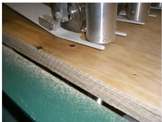
Inspection channels on LVL