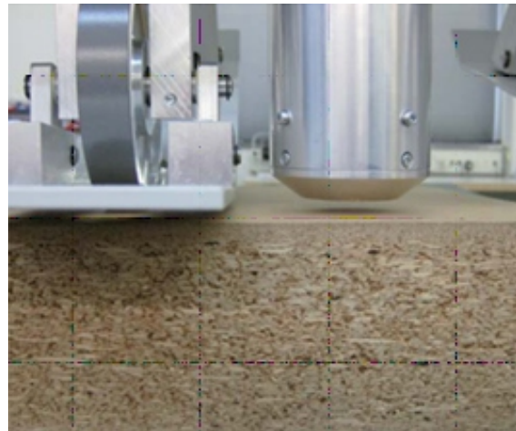
Inspection channels on thick particleboard